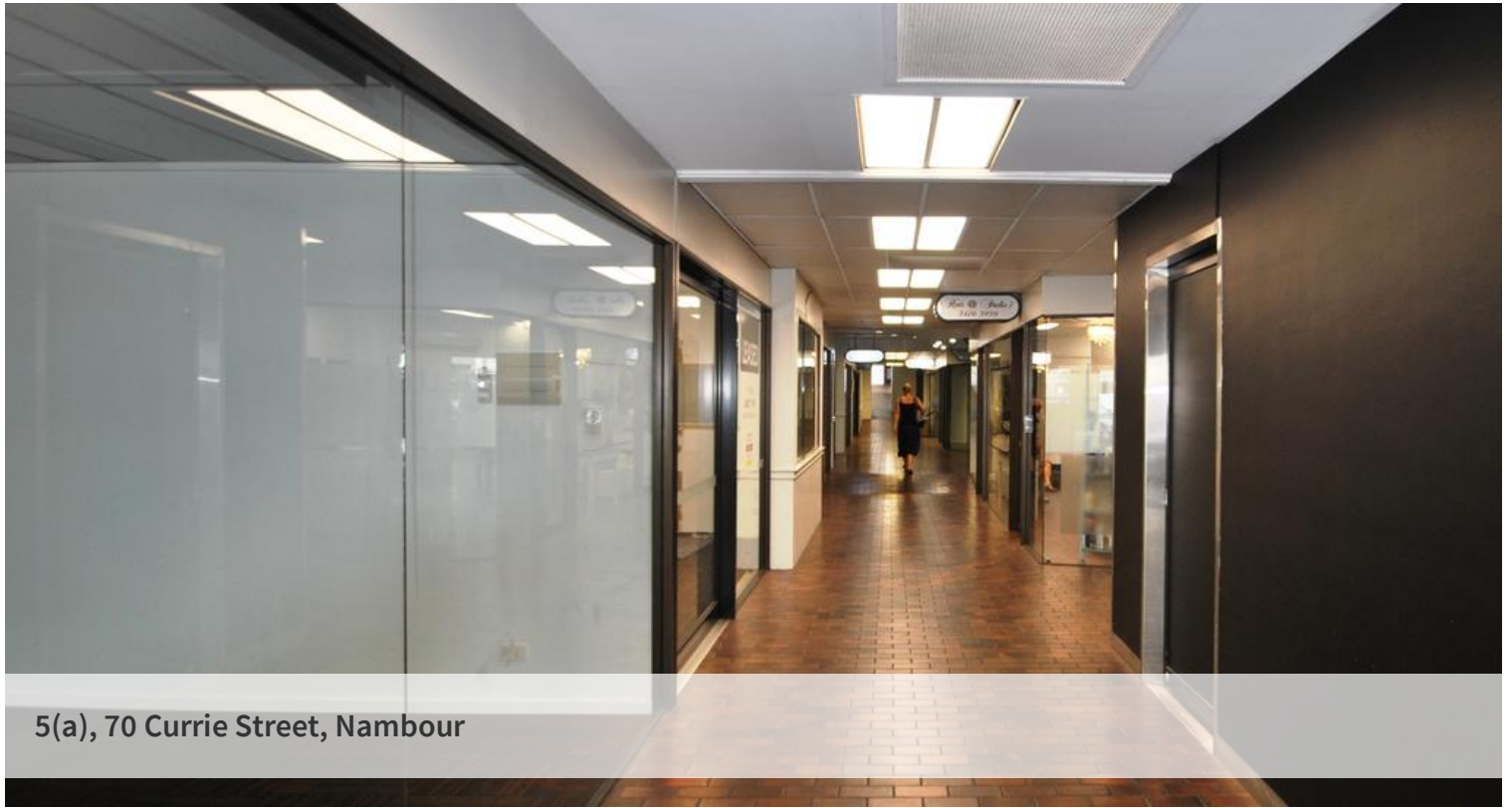
5(a), 70 Currie Street, Nambour