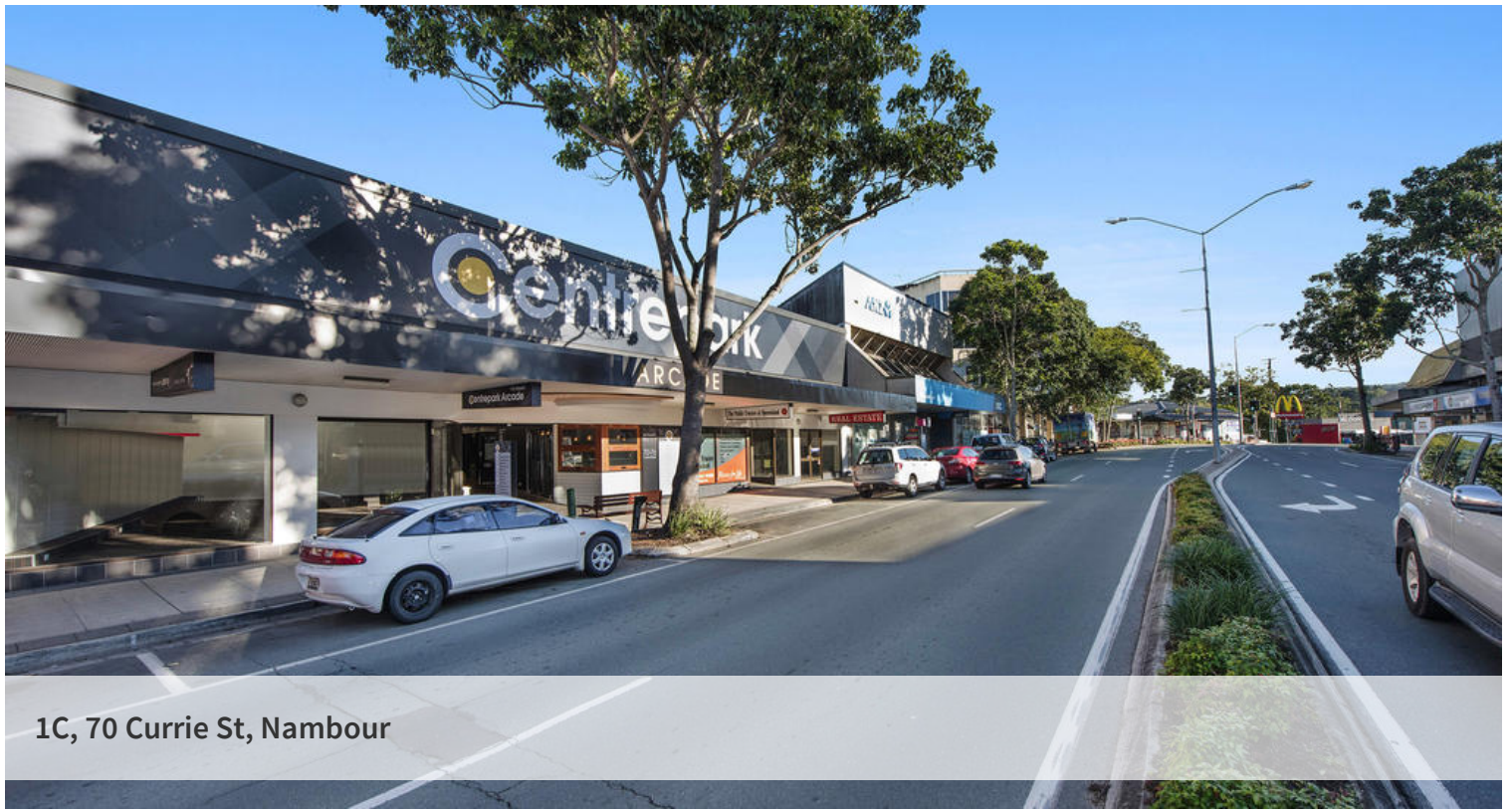
1C, 70 Currie St, Nambour