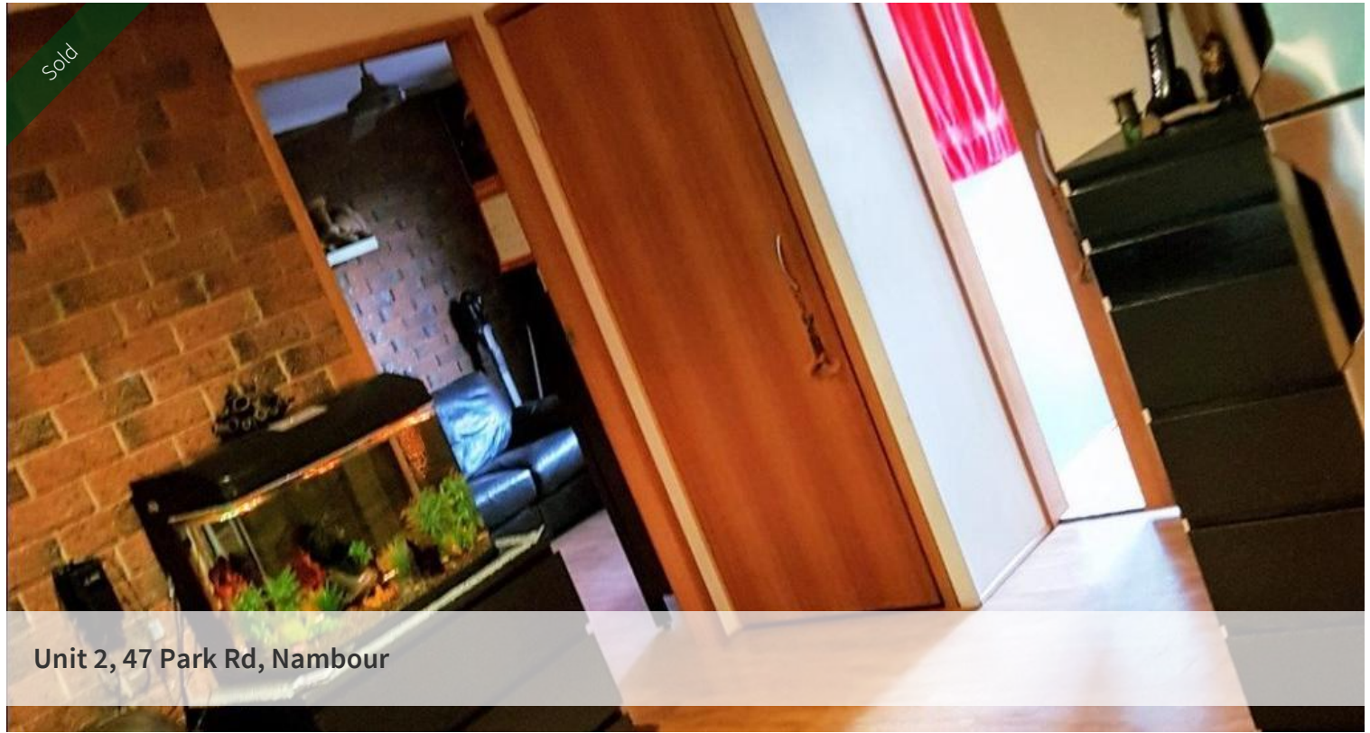
Unit 2, 47 Park Rd, Nambour